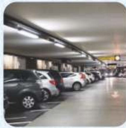
COVERED CAR PARKING