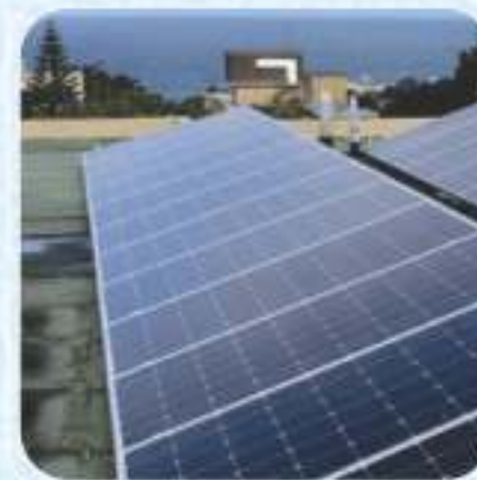
SOLAR POWER COMMON